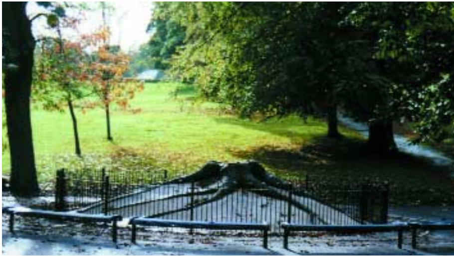
Fossilised tree in Lister Park

English Landscapes was delighted to be awarded an external works package, worth £1.5 million, at Lister Park, by Bradford Metropolitan District Council. Bradford MDC were awarded more than £3 million from the Heritage Lottery Fund for the restoration of this 21 hectare Victorian Park. This project has formed a 'first of its kind' for the Heritage Lottery due to the listed nature of the park and the extent of the restoration works being undertaken.