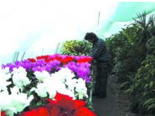
Maintenance and care of internal plants used for functions, including the 'Mayor-Making' ceremony

We are in exciting times with success coming from the enthusiasm and commitment of all our staff – especially those on the ground – in producing a job we can be really proud of.