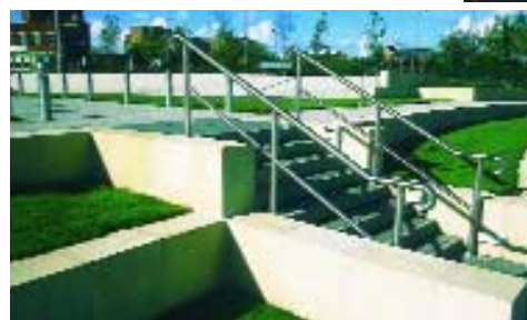
Landscape Architects: Mason Richards