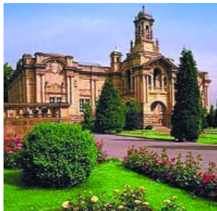
Cartwright Hall (prior to park restoration).